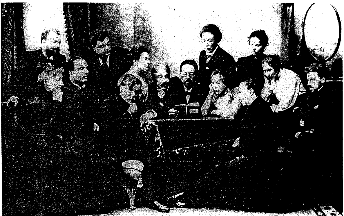
Figure 4.13 Anton Chekhov reading The Seagull to the actors of the Moscow Art Theatre.