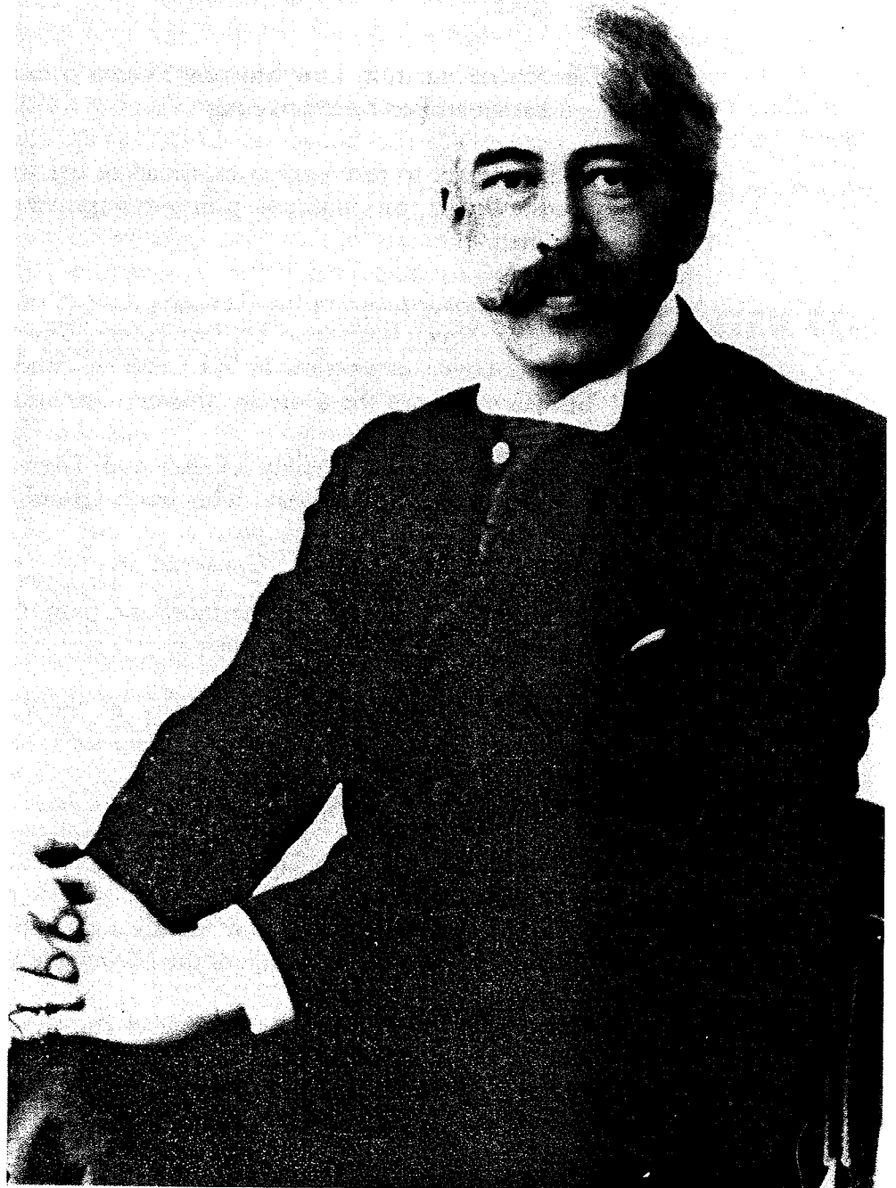
Figure 4b Konstantin Stanislavski at the time of founding the Moscow Art Theatre