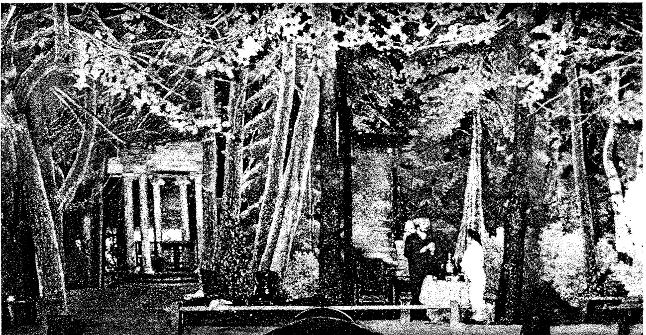
Figure 4.12 A photograph of Act 1 of The Seagull at the Moscow Art Theatre, 1898.