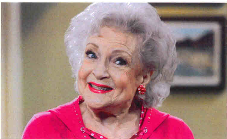
Image 3: http://www.inquisitr.com/wp-content/2011/08/Betty-White-Starring-in-Hot-In-Cleveland.jpg

The main cast would be five people. Other people may appear shortly, but since the production will focus on family, these would be the key people. Their costumes would be black in the first act directly after the funeral, but they would change into brighter colors for the second act. Also in the production, limited sound effects would be used, but they are not a major focus.