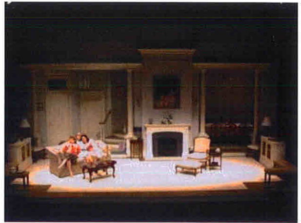
Image 8 - http://www.yorku.ca/finearts/faculty/profs/silver/images/sistersrosensweig.jpg

The performance would mainly take place inside the house of the family, with a similar set design to the one seen in Image 8. However, the set design would be more modernized, to make it look like a current living room for a family. It would include a TV and a sound system, which would both be used. The lighting concept would be similar to the one seen in Image 8 as well, however whenever the children are narrating, they would stand in a single spotlight, while the rest of the stage was dark,